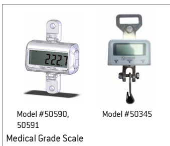
Model #50590, 50591 Model #50345 Medical Grade Scale