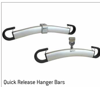
Quick Release Hanger Bars