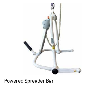
Powered Spreader Bar

Our lift accessories are manufactured to the highest quality standards and are designed to complement and increase the functionality of our lift systems. Simple to install and easy to use, these accessories help to adapt the lift solution to each individual need.